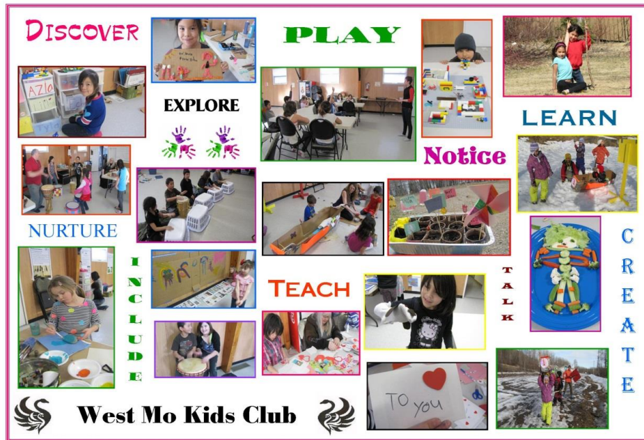
West Moberly First Nations - West Mo Kids club (2014 - Moberly Lake)