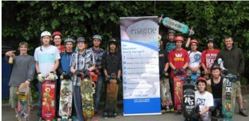
Prince Rupert RCMP - Long Board Safety (2014)