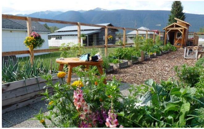
The Robson Valley Community Learning Project - The Open Gate Garden, Phase 2 Expansion (2014 - McBride)