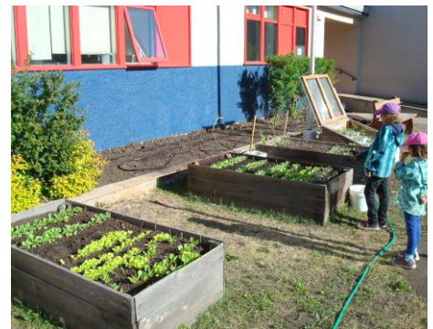
Groundbreakers Agricultural Association – Learning Gardens and Local Food Education Project (2014)