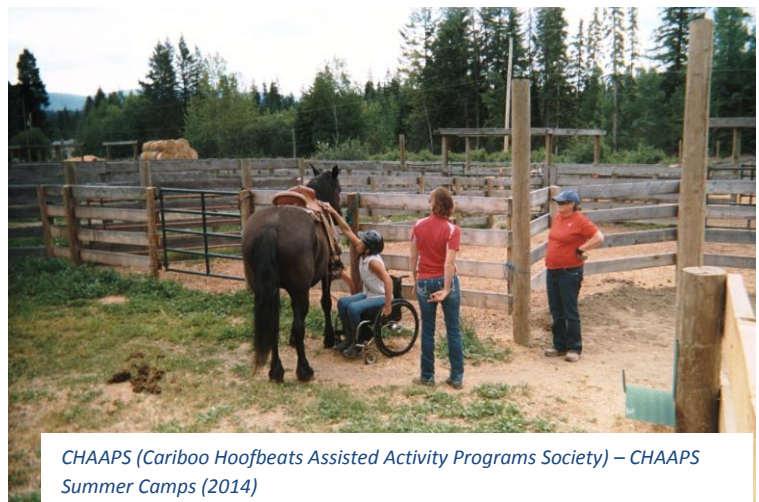
CHAAPS (Cariboo Hoofbeats Assisted Activity Programs Society) – CHAAPS Summer Camps (2014)