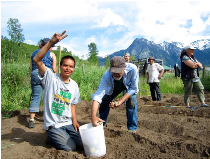
Storytellers' Foundation – Backyard Gardeners (2014)