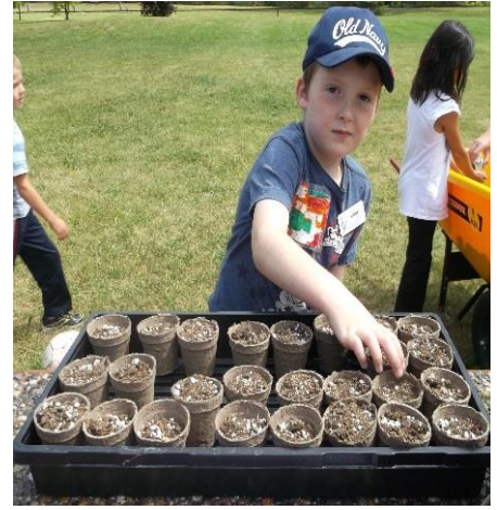
The Exploration Place – Explorers Urban Garden (2014)