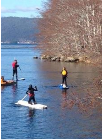
Agnes L. Mathers School – Outdoor Education (2014)