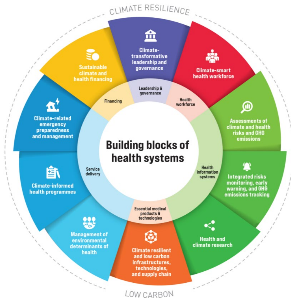
▲ Figure 3. World Health Organization Framework for Climate Resilient Health Systems, 2023.

Northern Health collaborates with government ministries and other BC Health Authorities on the provincial and federal level to address climate risk to health and the healthcare system. Aligned with Provincial efforts to move towards a climate resilient health system, Northern Health has adopted the internationally recognized World Health Organization Framework for Climate Resilient Health Systems (see Figure 3 below). A health system that is climate resilient is “capable of anticipating, responding to, coping with, recovering from, and adapting to climate-related shocks and stress, to bring about sustained improvements in population health, despite an unstable climate”. This framework demonstrates that addressing climate change is a shared responsibility of the entire health system, with concrete steps taken at all levels and across all portfolios. Reconciliation must also be a key factor in all aspects of this work.