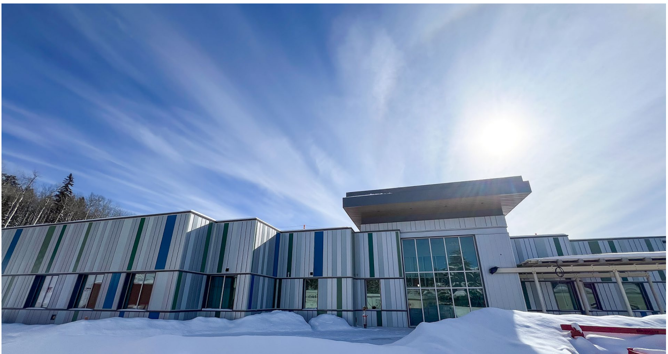
▲ New Stuart Lake Hospital, Fort St. James, taken March 2024.

In 2023, the bulk of the construction on the new Mills Memorial Hospital was completed and construction progressed well for the new Stuart Lake Hospital. Both hospitals were designed to LEED Gold certification. The new Mills Memorial Hospital is designed to emit at least 70% less GHG emissions per square metre compared to the current facility. The new Stuart Lake Hospital is designed to emit almost 50% less GHG emissions per square metre compared to the current facility.