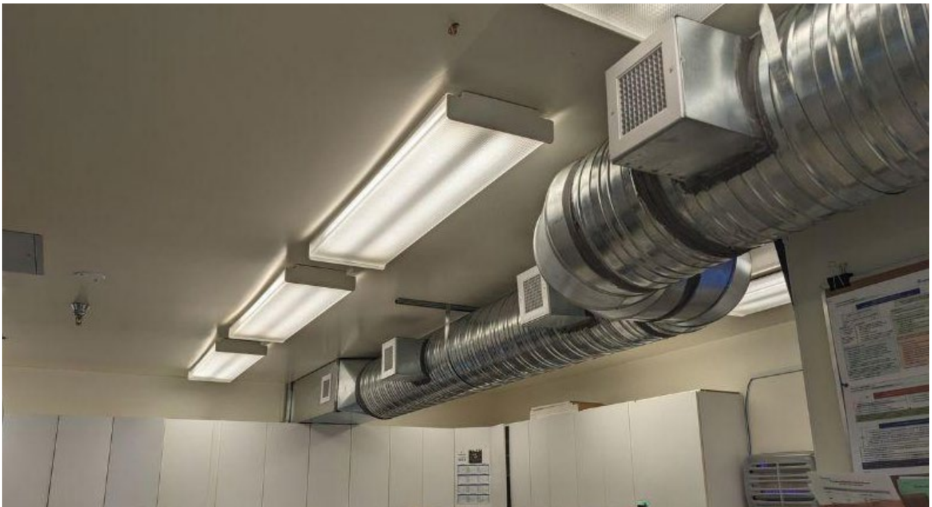
▲ Upgraded AC ductwork inside the Chetwynd General Hospital lab

For our new builds, we continue to plan and build towards better than LEED Gold baseline for energy performance.