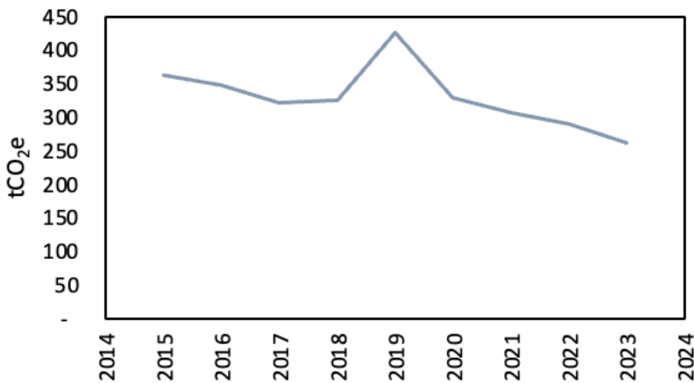
▲ Figure 2. Northern Health paper GHG emission trend.

In partnership with Provincial Health Services Authority, the health sector continues to work with suppliers and vendors to identify reasonably priced post consumer recycled paper. This, along with looking at ways to improve our printing behaviour has shown a downward trend over the years for paper emissions.