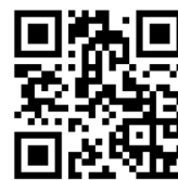
BC Self Assessment Tool