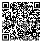
NH COVID-19 Information public webpage