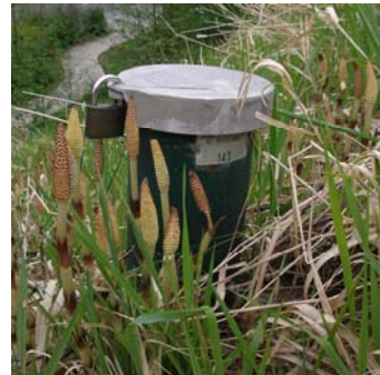
Contaminated flood waters can enter wells.